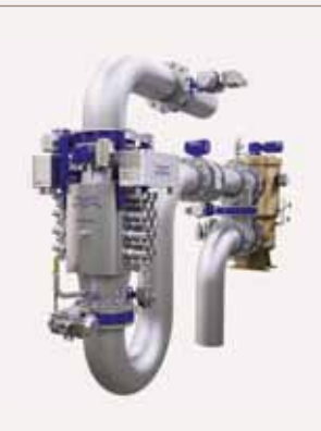
Alfa Laval PureBallast

The IMO Ballast Water Management Convention was ratified in September 2016. As of September 2017, when the convention comes into effect, all newly built ships will be required to have an on-board ballast water treatment system, while existing vessels will be given until their next scheduled drydocking date.