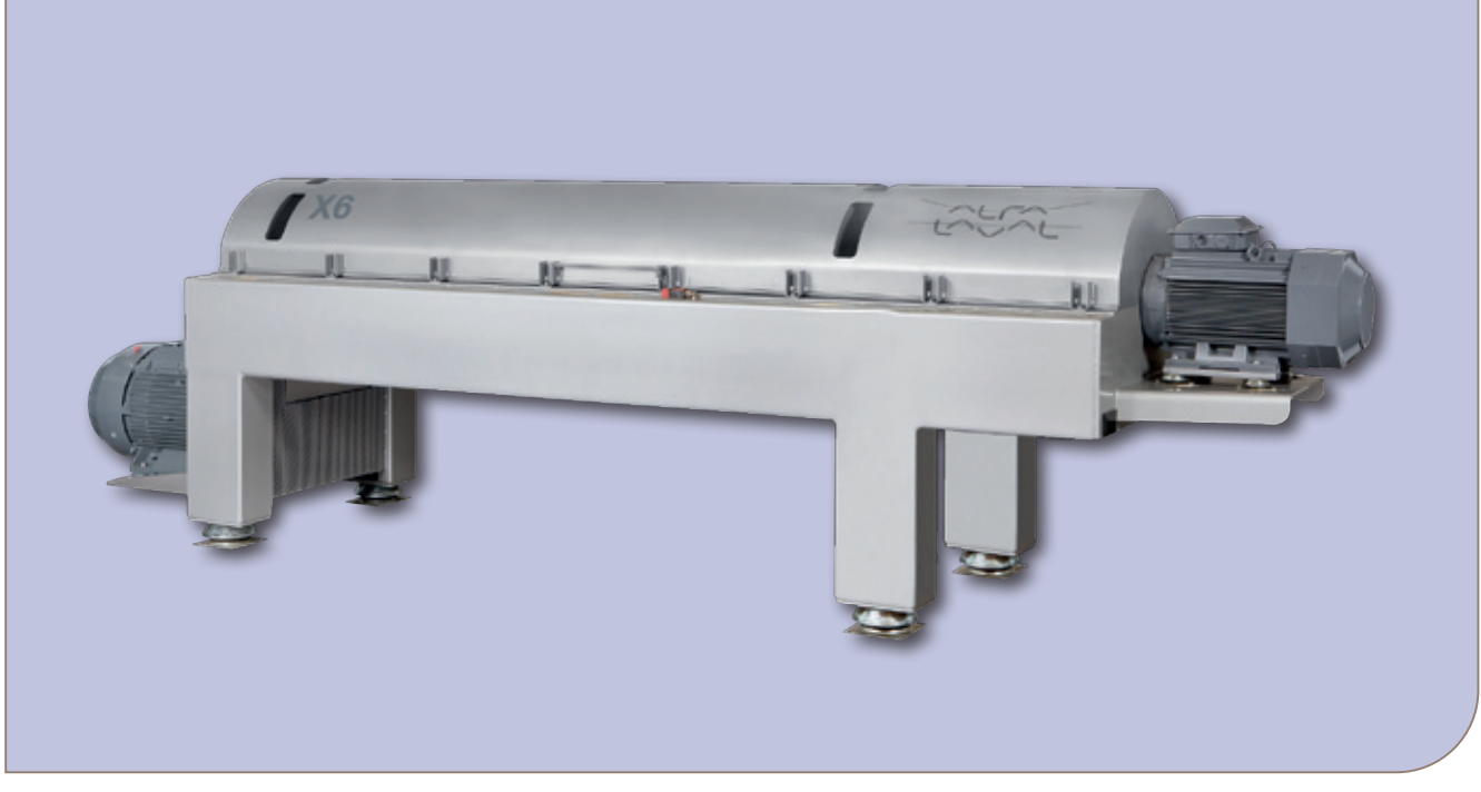
The X6 decanter centrifuge