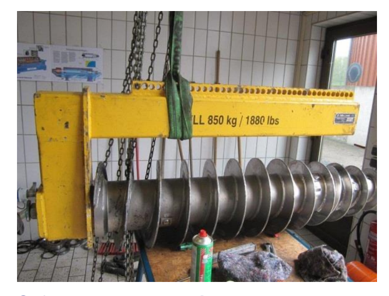
Safe conveyor handling