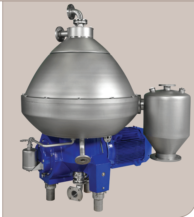
OF 700 oil dehydrator complete with motor

The OF 700 dehydrator is used for treating water-containing oil streams, separating two non-miscible liquid phases, at the same time removing suspended solids with particle sizes from approximately 0.5 to 500 µm from liquids having lower densities than the solids. The recommended capacity is defined case by case. Alfa Laval has long experience in the application and will ensure optimal separation performance.